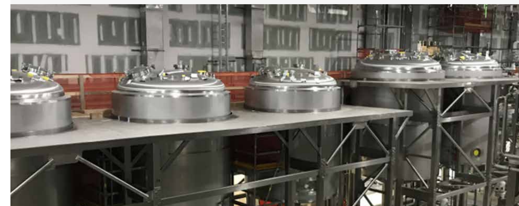
Insulin production process